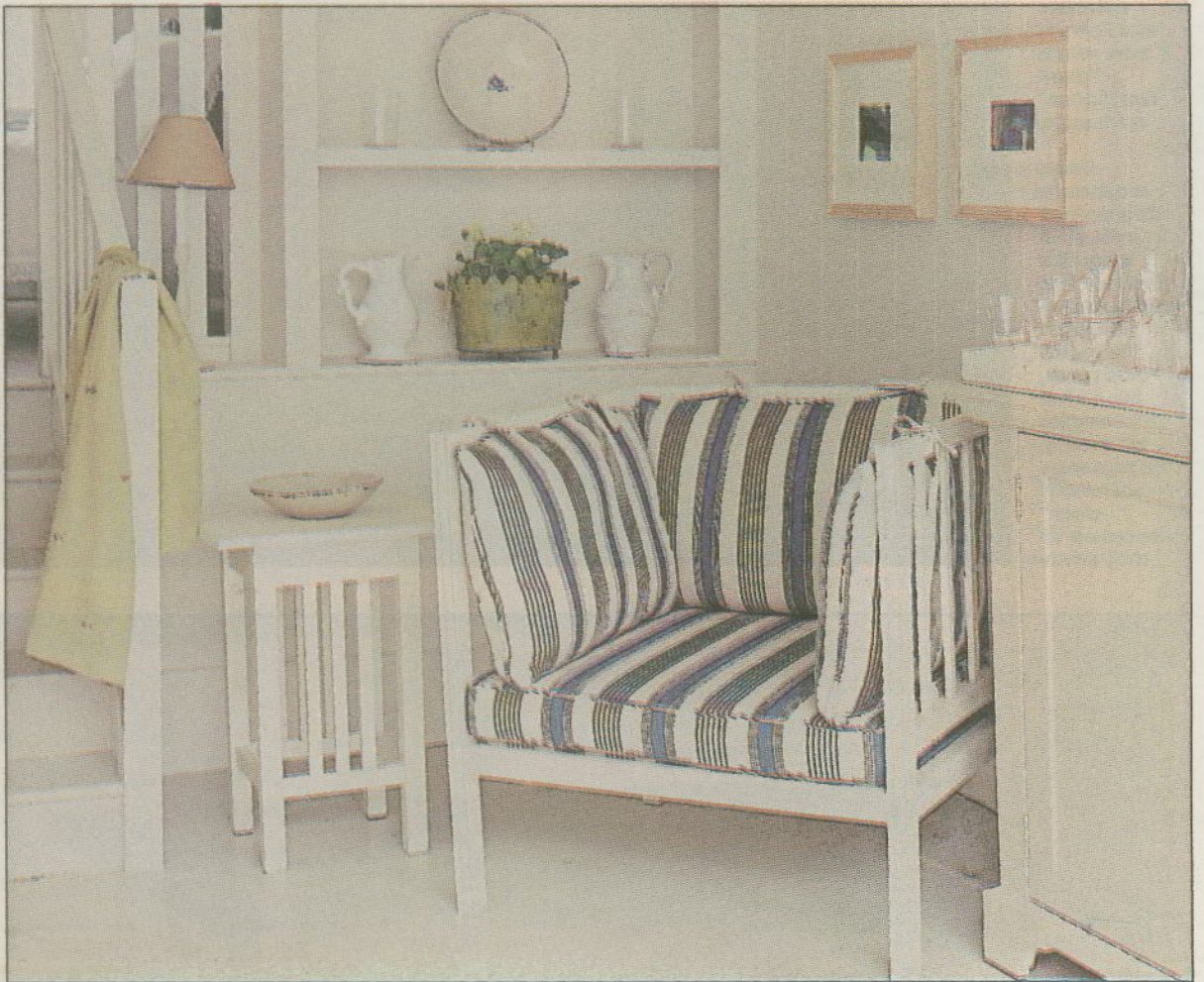
Simple and fresh: Skansen chair and side table from Sasha Waddell's newly launched Plain Range

Sotheby's summer workshops: If you've got time to spare, why not enrol on a Sotheby's Institute summer workshop? It's too late to enrol on the first, on fine art,